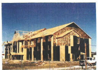
Framing lumber, floor, wall and roof sheathing plywood

A first class flame retardant for most applications. If you are like millions of people today who do not know today's technological advances. You might think nothing can be done to prevent whole house, apartment and building fire burn-outs. Not true! For the past 12 years fire prevention and technology of fire retardant applications have made wood structures now fire safe and reduced smoke more than 70%. Universal Fire-Shield Fire Retardant Chemicals can and do protect like no other product known. It also prevents black mold and mildew.